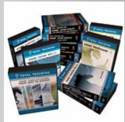
Image from the Total Training web site.