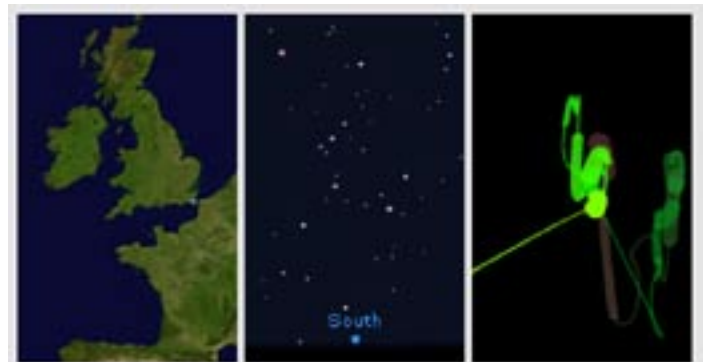
Screen shot from Neave Labs shown the map, planetarium, and creative exercise options.

Neave is a programmer who was fiddling with Flash one day and discovered that he could create a zoom-in world map that is awfully close to what the Windoze people see when they visit Google. You can find it at http://www.neave.com/lab/flash_earth/ . There are also other fun goodies to explore, such as a planetarium, a chance to let your imagination run wild, and on-line versions of some old video games. Give it a look-see sometime!