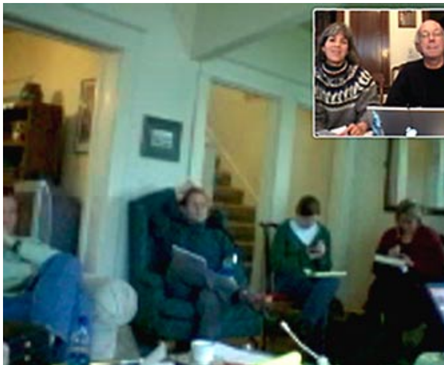
iChat-AV screenshot shows the Portland meeting in the large image, Roseburg participants in the smaller. Note how better lighting improves the quality.

According to the wikipedia (en.wikipedia.org), "iChat-AV is a AOL Instant Messenger (AIM) and Jabber client for Mac OS X. Using a Jabber-like protocol and Bonjour for user discovery, it also allows for LAN communication. iChat-AV's AIM support is fully endorsed by AOL, and uses their official implementation of the AIM OSCAR protocol." In simpler terms, iChat-AV opens a window on your computer screen, and another window on the screen of a buddy who also uses the software. The two of you can then type text messages back and forth, or exchange audio (just like a speakerphone), or send the video and audio together. The