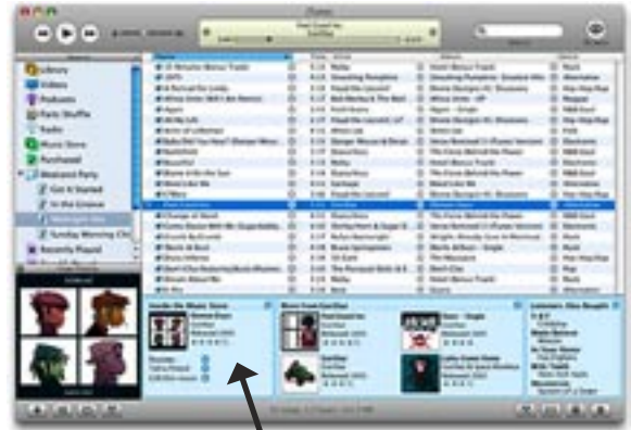
The dreaded "MiniStore"!

To be completely fair, many users claim that Apple should have announced way in advance that iTunes 6.0.2 would obtain person data from the user's computer - in this case, reporting to the iTunes MiniStore which songs the user played so that the store could make recommendations of similar songs to purchase - and also have asked for and obtained the users' specific consent even before downloading iTunes. It's not enough for Apple to provide an after-the-fact method for opting-out; people tend to get tweaky when companies hide the fact that they are collecting information about users, their recreational habits, and their purchases.