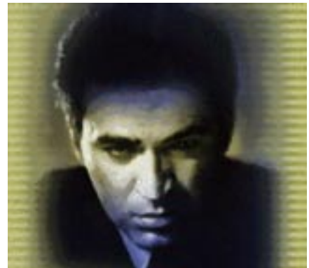
Gary Kasparov, chess Grand Master

added to their Amazon dot com account. Just like the original Turk, requesters have the experience of interacting with a machine