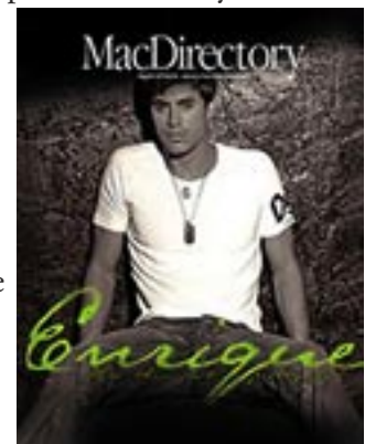
MD is the premier digital lifestyle mag for Macs!